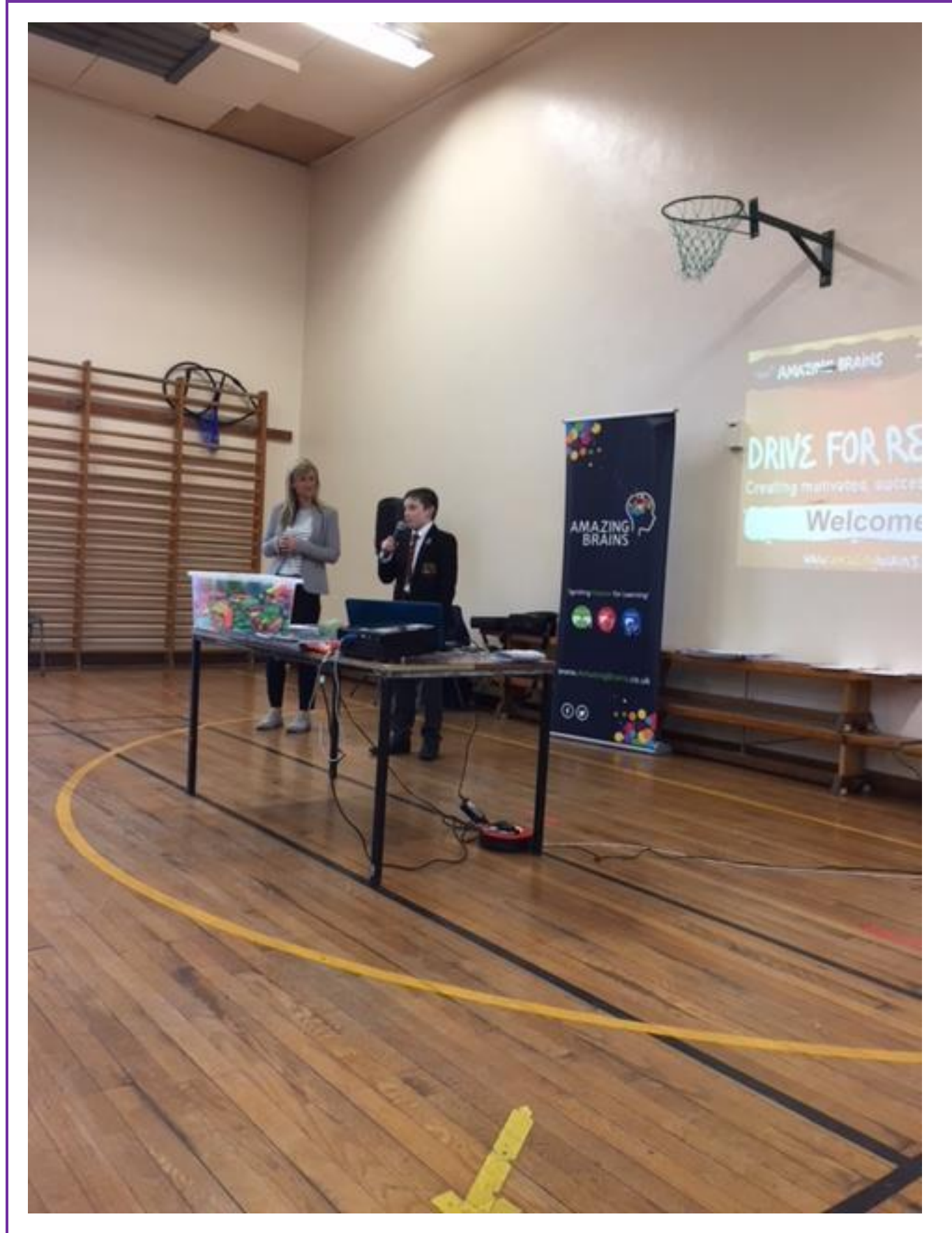
Amazing Brains with Year 10 pupils focussed on exam pressure, preparation and subject choices .